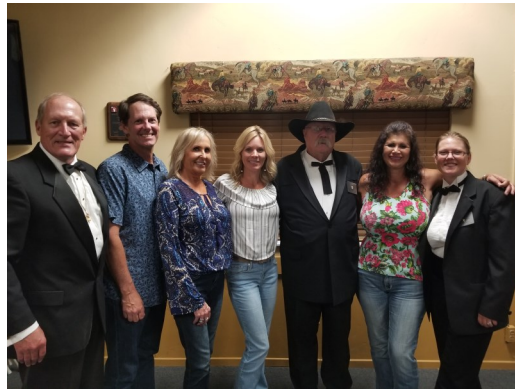
New members initiated on September 20th.